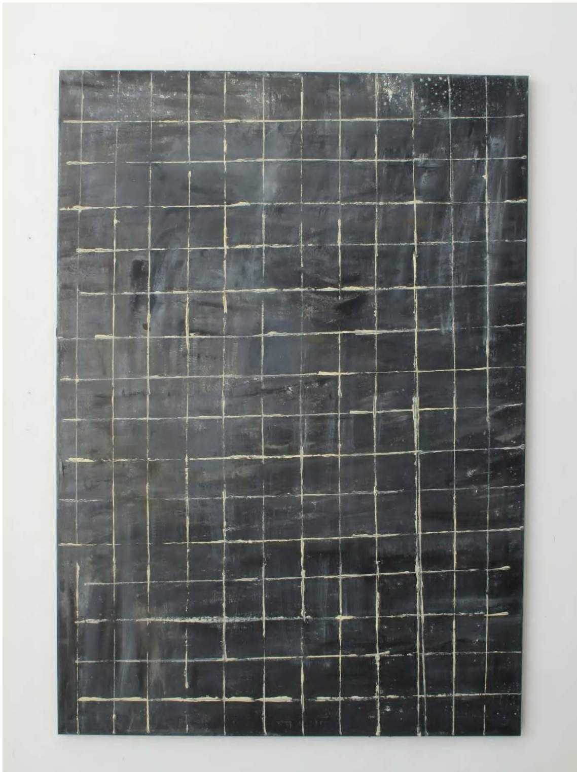
F k /Pink molding2012 2013