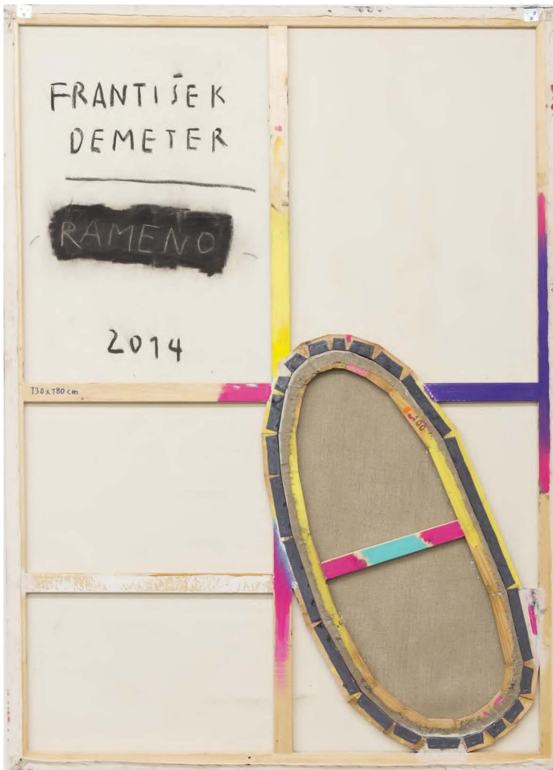
7 ) Rameno/ Branch2014