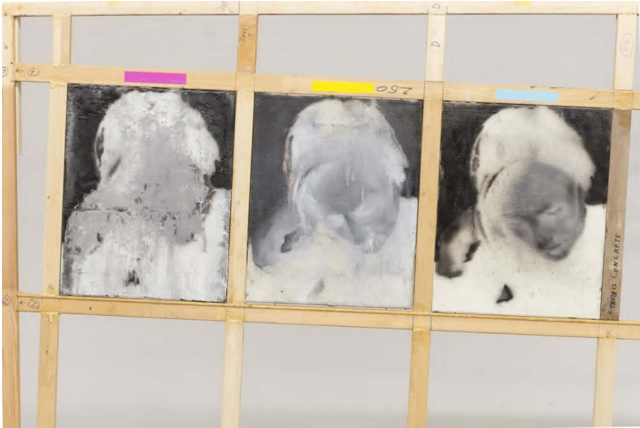
# 7 olej a 2014 detail