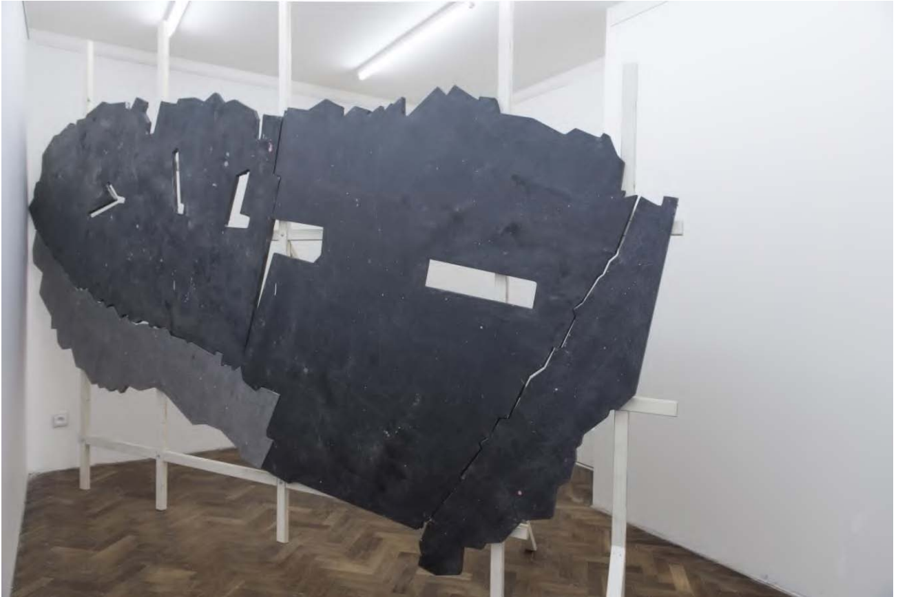
7 ) h on easel, 2014 # akryl a ; 180 x 420 cm r

7 V@- ' V\ ' V@- ' V\ ' - o' V\ 10. 9-24. 102014